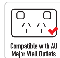
Compatible with All Major Wall Outlets