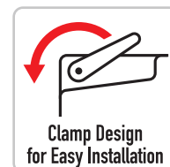
Clamp Design for Easy Installation